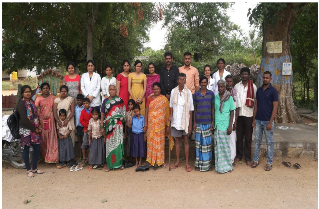
Photograph 7 & 8: Participants of environmental awareness programme.