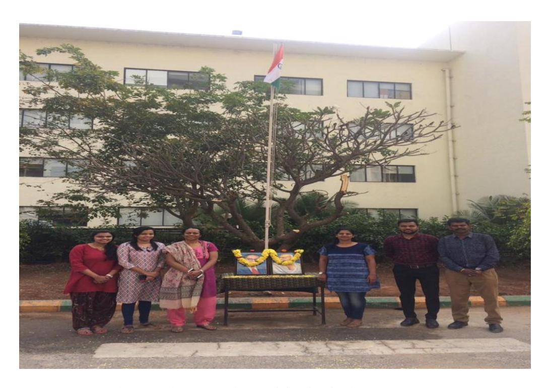
Photograph 12: Faculty participating in the programme.