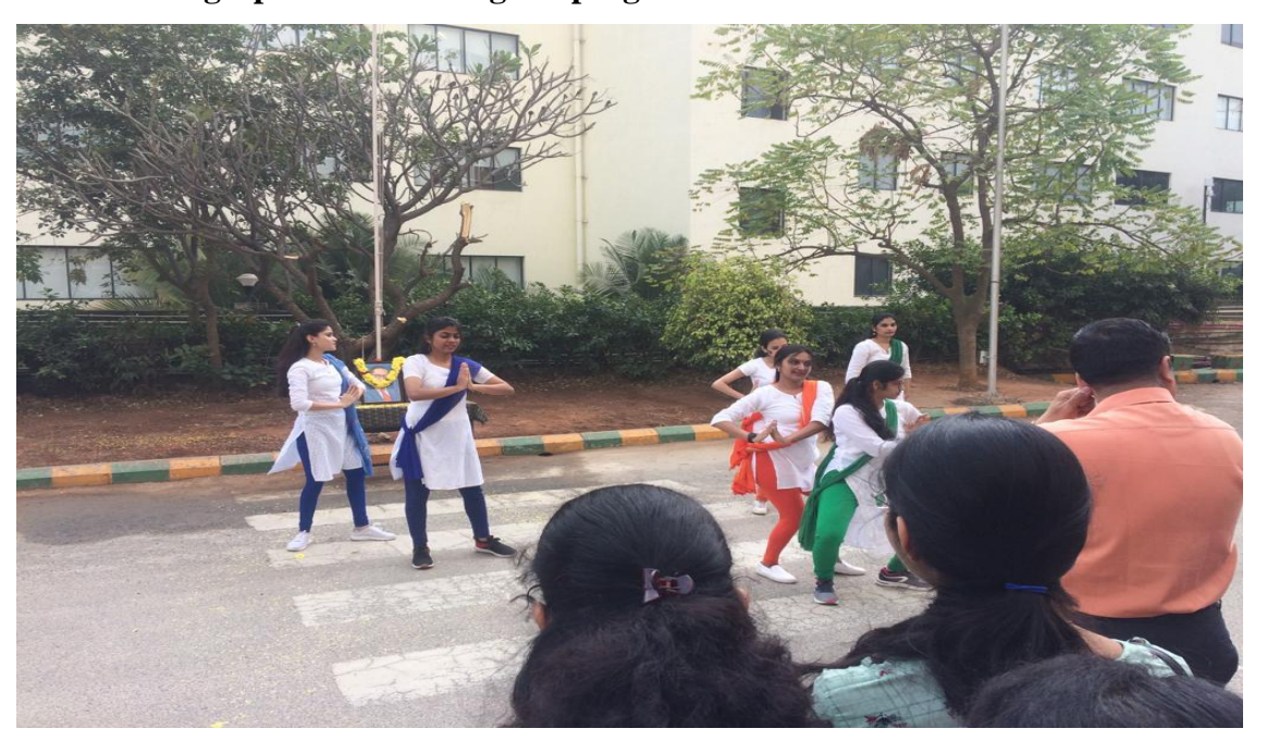
Photograph 9: Cultural event during the programme.

The Cultural Event (Dance Performance) was organized by interns of the college and programme was concluded with a vote of thanks given by Dean and Director.