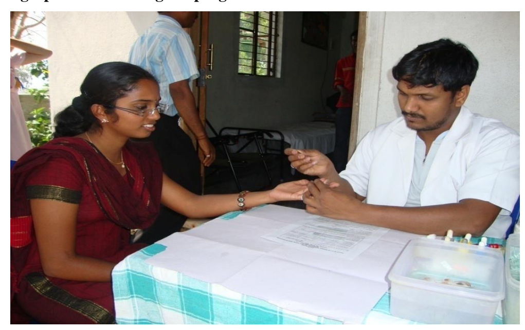
Photograph 1: Sample collection for blood grouping