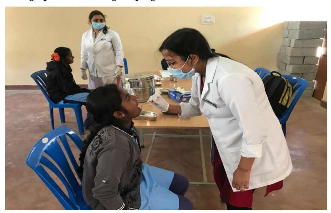
Photograph 3: Screening performed at the camp site

It was a successful event and we wish to achieve more success in our future endeavours.