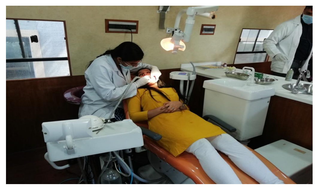
Photograph 4: Treatment performed at the camp site in the mobile dental unit